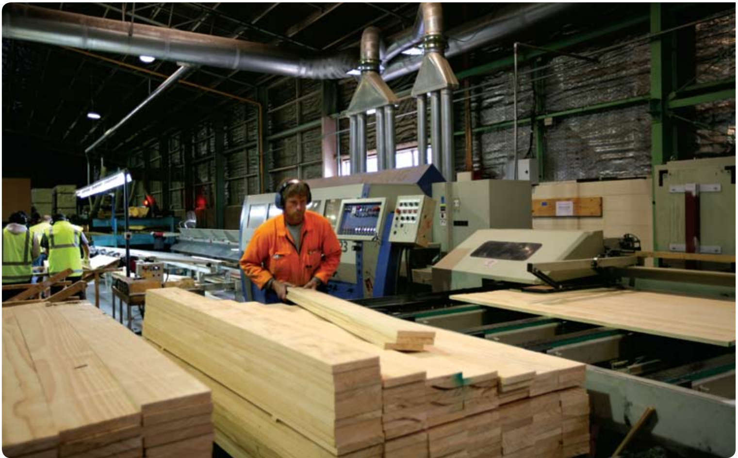
Operators at workstations with the extractor fans and Ecogate system in place.