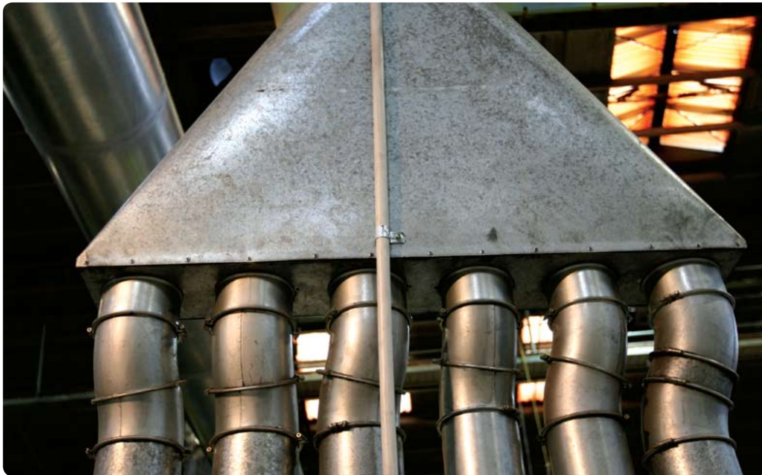
The Ecogate system is installed on each dust extractor fan at the plant.

PWP's ethos of sustainability and environmental focus is further demonstrated through its waste management actions. At its plant all residual sawdust and shavings are returned to the Pan Pac plant for use as biofuel in their two boilers. This energy is then used to generate steam for their cogeneration plant and low-pressure bypass steam for kiln drying lumber.